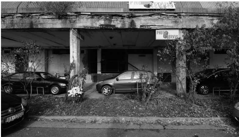
THE GENERALLY BAD CONDITION OF THE TERRACES THROUGHOUT PETRŽALKA